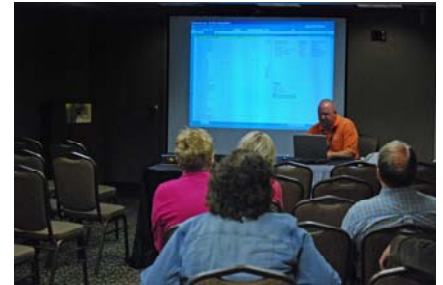
2008 Fall Conference

Pornography is not just for computers anymore. One can now also download porn via gadgets such as Play Station Portables (PSP), iPods, and even cell phones. Children can also trade or share an array of inappropriate media via their gadgets via wireless, bluetooth, or cell phone connections.