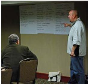
2008 Fall Conference