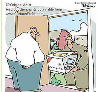
"It's another e-mail from your folks. You know, this would be a whole lot easier if you'd just tell them about the Web."

Today students face the complexity and challenges of life and need highly skilled school counselors to help them navigate around complicated experiences.