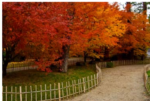
Fall in the Inland Northwest