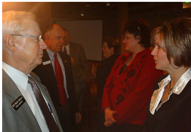
Counselors talk with their area Representatives at the Legislative Lunch in January

This week has been promoted in many Idaho education newsletters